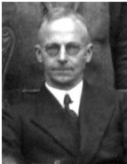
E. T. Whittaker in 1930

he developed an interest in Astronomy. This led in due course to his appointment as Astronomer Royal of Ireland in 1906, and at the same time he became Professor of Astronomy at the University of Dublin. However, on the death of George Chrystal, he came to the University of Edinburgh in 1912 to fill the Chair of Mathematics. In 1913, he opened a Mathematical Laboratory in Edinburgh where students were trained to do machine calculations. Subjects to be taught included interpolation, difference formulae, determinants, linear equations, the numerical solution of algebraic equations, numerical integration, least squares and the numerical solution of differential equations. When the list of topics became known, it generated such interest that the Edinburgh Mathematical Society organized a colloquium in the summer of 1913 with the primary aim of providing instruction in aspects of numerical mathematics.