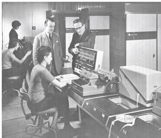
The Manchester Atlas Console