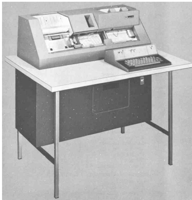
Card punch machine

About 1971, the Kent Operating System provided on-line remote programming to the Elliott 4130 using BASIC. Teletypes laboriously printed at about 110 Baud (10 characters per second). A Modular One minicomputer was added as a front-end processor for remote access which by 1974 allowed dial-up modems at 2400 Baud. The Elliott 4130 was replaced in 1977 by a DEC System 10. Microcomputers arrived in 1979 (the BBC micro was about as powerful as the Elliott 4130), and around this time, email became possible to a limited range of contacts. The campus was wired for remote access to the DEC10. Mathematics acquired (black and white) VDUs (Visual Display Units), some of which could work at 4800 Baud, while others only managed 1200 Baud.