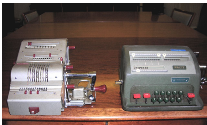
Brunsviga (left) and Facit